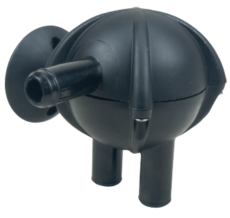
Fig. 0733 Left Facing Mount Shown for 5/8" Hose

O. INC. N.W. 13th Avenue FL 33169-5707 erko.com